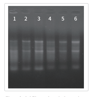
Figure 2: Gel Electrophoresis Comparison

Conclusion: The results indicate that MagaBio Plus Whole Blood Total RNA Purification Kit with product number BSC113 yielded a higher product concentration.